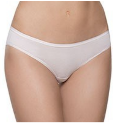
36-48 10 PA, 80 COTTON, 10 ELASTAN