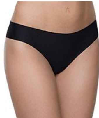
75 COTTON, 10 PA, 10 ELASTAN, 5 VISCOZE