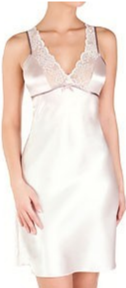
14598, 36-44, 885 Coffee rose, 100 PES